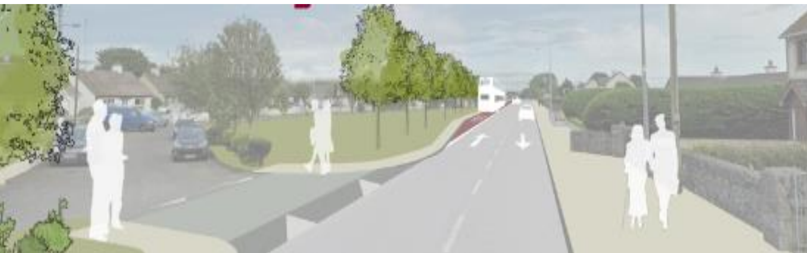
Fig 1 – 3D Visualisation of Ballybrit Crescent

All parties involved acknowledge that the works will cause disruption. We appreciate your patience and apologise for any inconvenience.